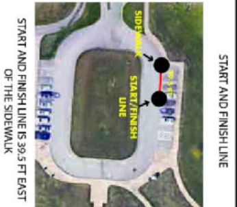
START AND FINISH LINE

START AND FINISH LINE IS 39.5 FT EAST OF THE SIDEWALK