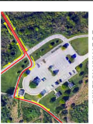
DOG PARK TRAIL MAP

THIS COURSE WAS MEASURED USING THE FULL WIDTH OF THE ROAD AND SHORTEST POSSIBLE ROUTE MAP NOT TO SCALE