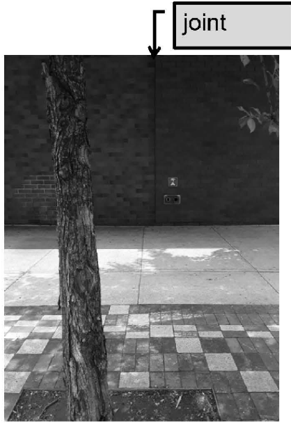
Photo of vertical joint in wall of the Atrium building on the west side of S. Salina St. The Start/Finish is aligned with this joint.