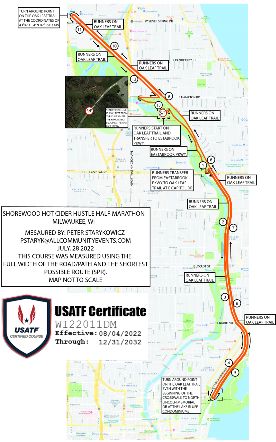
Map not to scale.